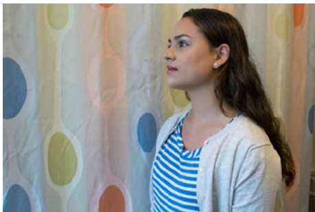
7 Hold your breath for 10 seconds.