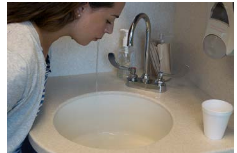
9 Rinse out your mouth. Spit.

This Family Education Sheet is available in Spanish